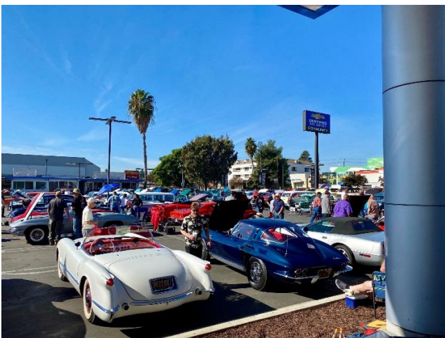
Just some of the 130 cars attending 2024