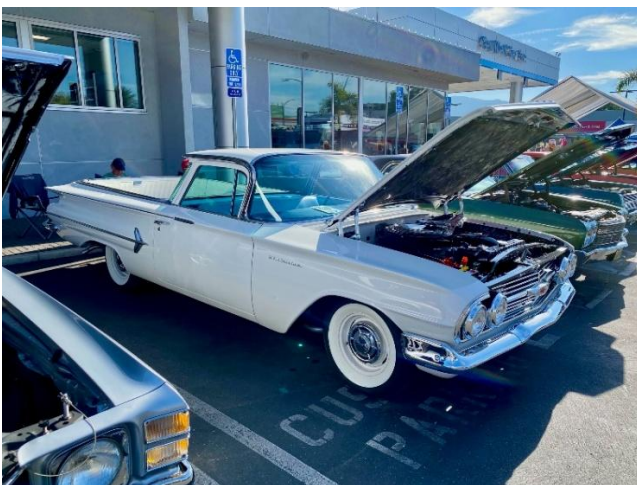
Last year's dealers' choice

As of this moment ONLY 4 members have sent in their entry form. If you will be @ the meeting Thursday, bring it & your check. Or email it to me & You can Zelle your payment.