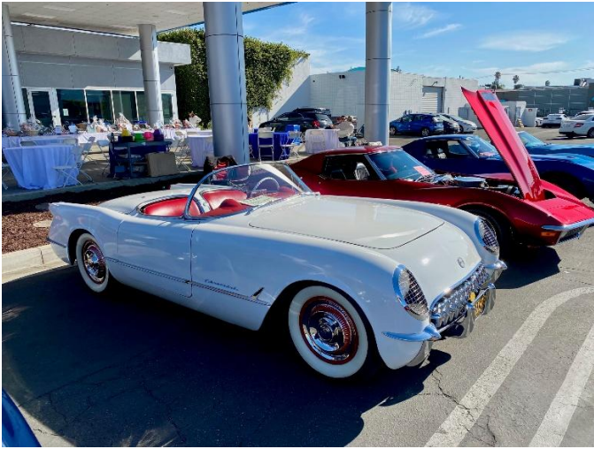
Corvette Row with my favorite '54