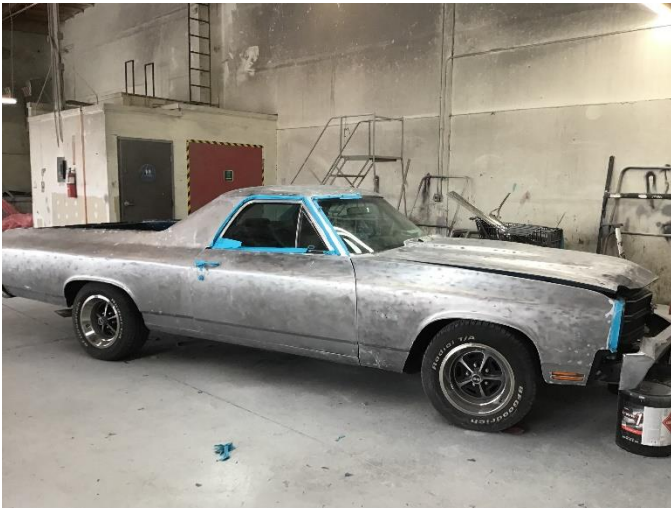
A naked 1970 El Camino

Once upon a time there was a king who was only 12 inches tall. He was a terrible king but he made a great ruler