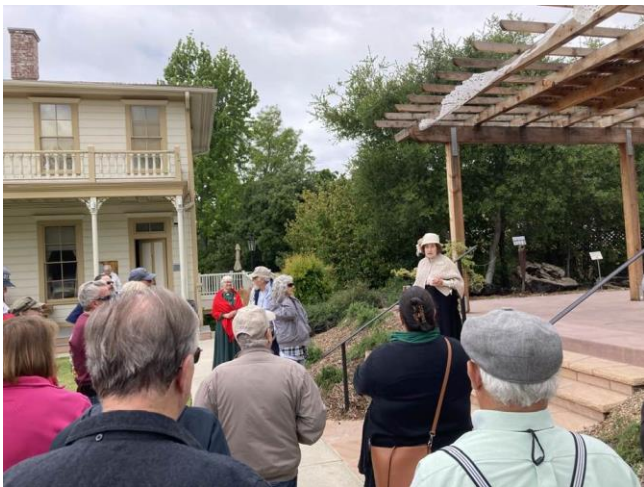
All Cal 1 st venue, the Stagecoach Inn

Chevy trivia What was the first vehicle Chevy shipped vertically?