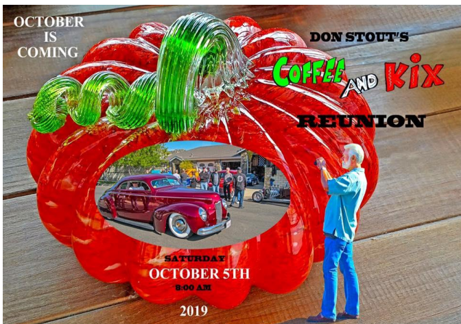
Don's Coffee and Kix coming up

https://www.hagerty.com/articles-videos/articles/2019/09/16/replacement-parts-that-keep-your-classic-alive?utm_source=SFMC&utm_medium=email&utm_content=Daily_News_Wednesday_Sept_18