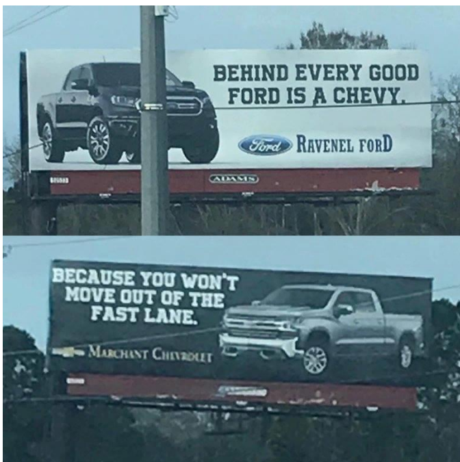
Dueling billboards ☺

All Cal is only 1 ½ months away ..... You can sign up on line @ www.vcca.org